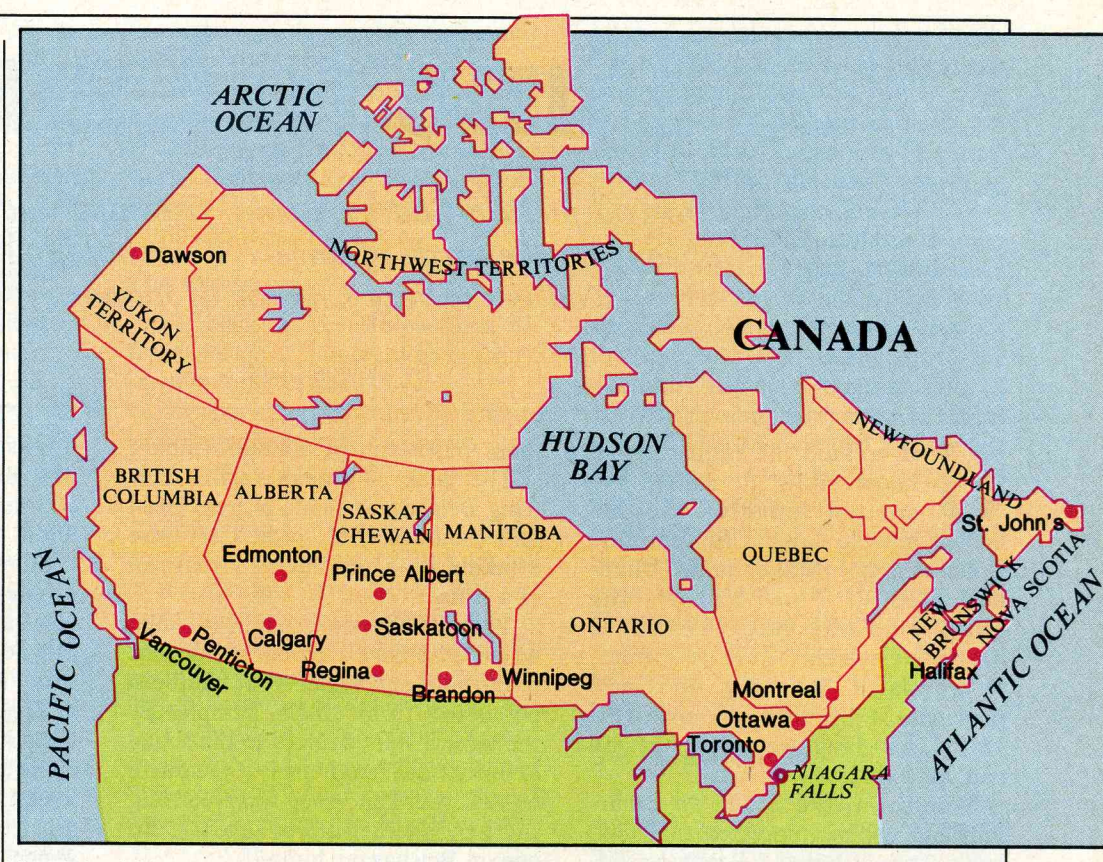
Canada has felt the Work's impact since the 1930s, when Herbert W. Armstrong could be heard on U.S. West Coast radio stations. Today Canada has 69 regular Church services and 28 outlying Bible studies.

A 1 percent yield has virtually doubled the circulation of The Plain Truth over a two-month period this year. The insert has appeared in German and French as well as