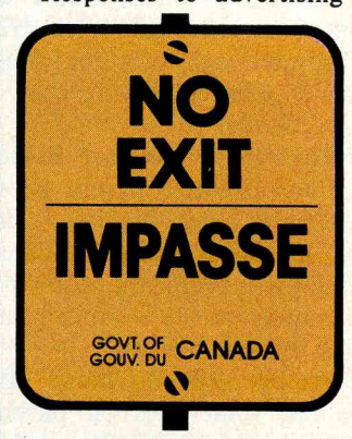
Signs like the one above are common in Canada because the nation has two official languages, English and French. Preaching the Gospel thus becomes more challenging.

offers in French have been traditionally good, whatever literature was offered. Current cost-per-response figures for French booklet ads in magazines run between 98 cents (U.S.) and $4.21 (U.S.)